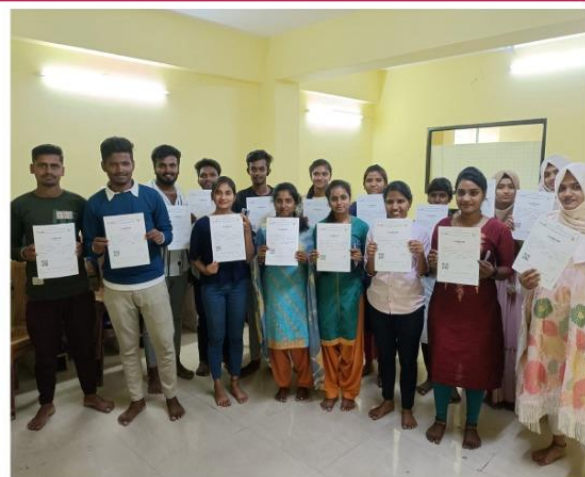
Exam And Certificate issuing